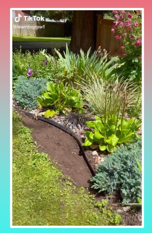
@learntogrow1: 71K followers 167K Views