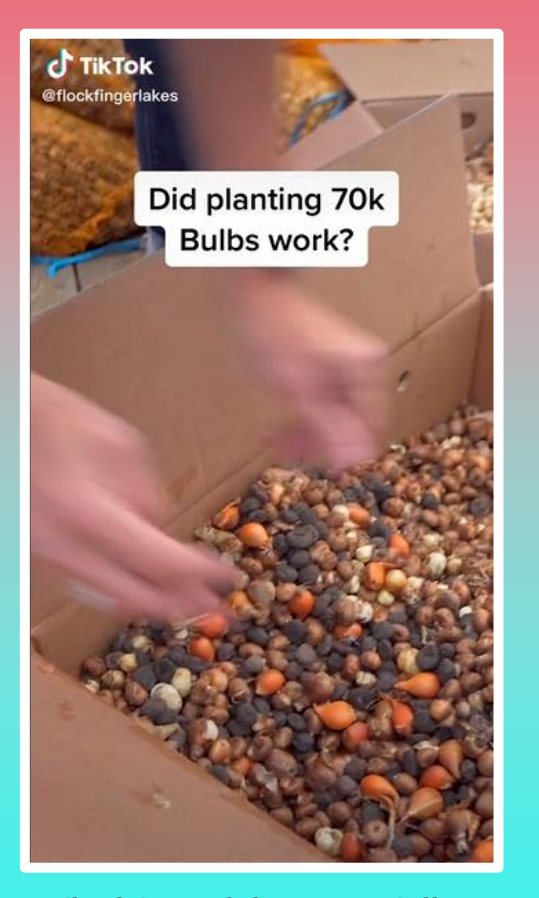
@flockfingerlakes: 14K followers2.9M Views