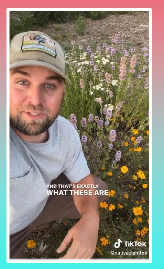
@nativeplanttok: 270K followers 1.8M Views